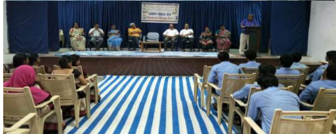
Shri Vijaymahantesh VidyaVardhak Sangh's