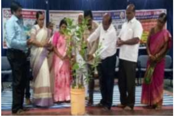
Shri Vijaymahantesh VidyaVardhak Sangh's