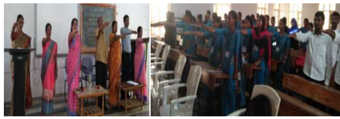
Shri Vijaymahantesh VidyaVardhak Sangh's S. R. KANTHI COLLEGE OF EDUCATION, ILKAL