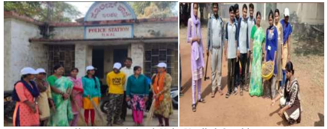
Shri Vijaymahantesh VidyaVardhak Sangh's