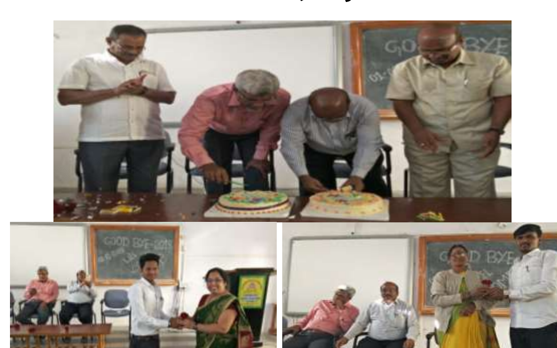
Shri Vijaymahantesh VidyaVardhak Sangh's